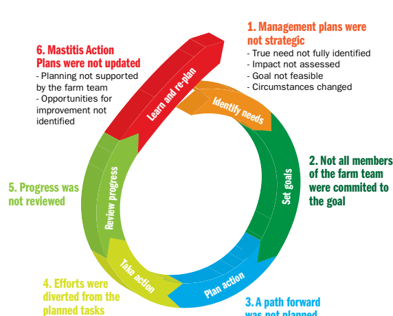
Figure 3: Stalling points, and potential reasons for stalling, on the action planning cycle (Nettle et al. 2006).