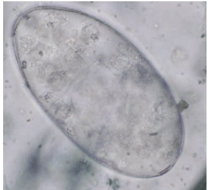
Rumen fluke egg

The finding at post mortem examination of large numbers of larval rumen fluke attached to the wall of the small intestine in an animal that showed the clinical signs described above is a very reliable way of confirming the diagnosis of severe disease due to immature rumen fluke ( larval paramphistomosis ). Note that carcasses must be fresh for accurate diagnosis as larvae detach from the intestinal wall shortly after the death of the host animal.