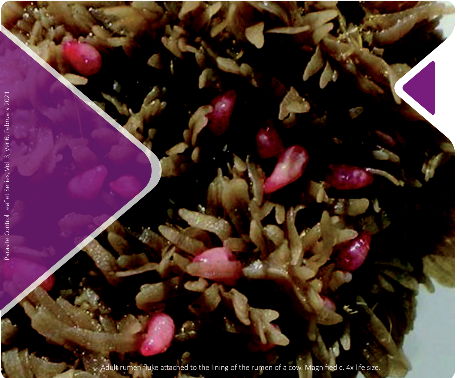
Adult rumen fluke attached to the lining of the rumen of a cow. Magnified c. 4x life size.